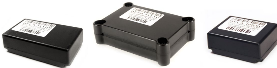
Figure 1 – Physical form of Vega M100 (left figure), Vega M110 (middle), Vega M50 (right figure).

If the device works with factory settings, the battery life can reach 2 years. In active tracking mode, the power consumption of the device increases, so the battery life is reduced to several days.